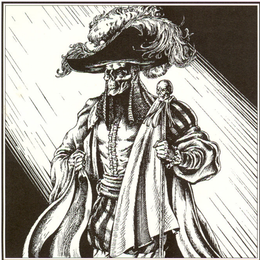
Erik as "The Red Death" at the masked ball

The next night, during a performance, Christine vanished on stage in front of a packed house! Knowing that the Phantom must have used trickery to abduct her, Raoul frantically rushed backstage to find the entrance to the catacombs. There, he came upon an individual known only as "the Persian." This man was a member of the secret police, and had been keeping track of Erik's movements since his days in Persia. In fact, the Persian helped in the ploy to get Erik out of the country when the Shah decreed that he be killed. The Persian persuaded Raoul to follow him and obey his every instruction – lest they both be killed by the Phantom's cunning. Erik had already proven his ability with the punjab lasso.