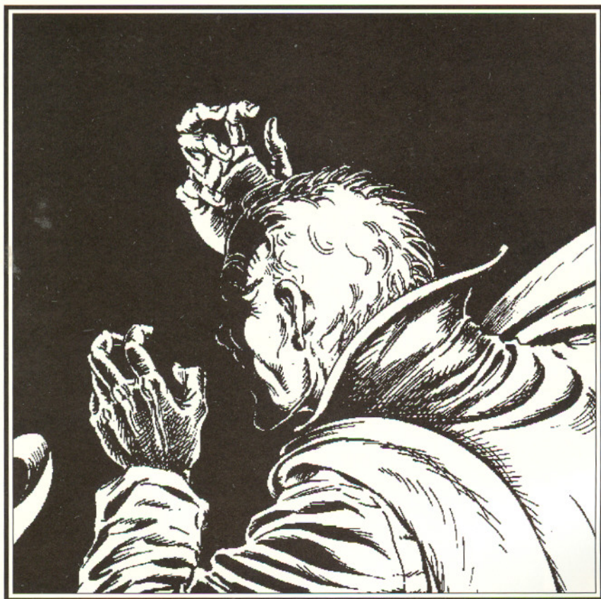
The Phantom unmasked

Raoul and the Persian made their way into the catacombs and finally to Erik's lair, where they inadvertently found themselves trapped in a "torture room." The room was designed such that extreme heat would eventually kill the helpless victims inside. But, on the brink of death, the Persian found a secret way out of the room, and the men made their way to a chamber full of gunpowder. The Phantom's intent became clear – if Christine didn't marry him, he would blow up the Opéra house!