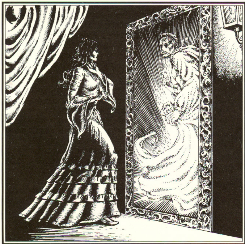
Christine and the "Angel of Music" in her dressing room

Shortly after this incident, the Phantom made a demand to the Opéra managers that Christine Daaé replace the prima donna, Carlotta, in a production of Faust . He threatened to curse the theatre if this demand was not met. Unfortunately for all concerned, the managers