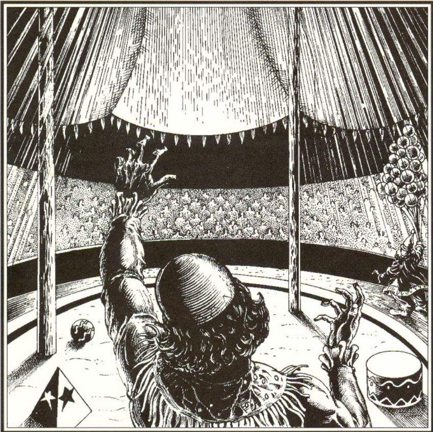
Young Erik singing in the circus.

Erik was born the son of a mastermason who lived in a small town not far from Rouen. They say that the first gift bestowed upon the child was a mask to hide his hideously deformed face. The sight of her own son so horrified his mother that she refused to nurse him. Because of the lack of love and understanding in his home, Erik ran away at a very early age. He joined a traveling fair, where a showman exhibited him as a "living corpse." He made a living in this humiliating fashion, crossing the whole of Europe. Cavorting with these vagabonds, Erik completed a macabre education as an artist and magician, mostly at the